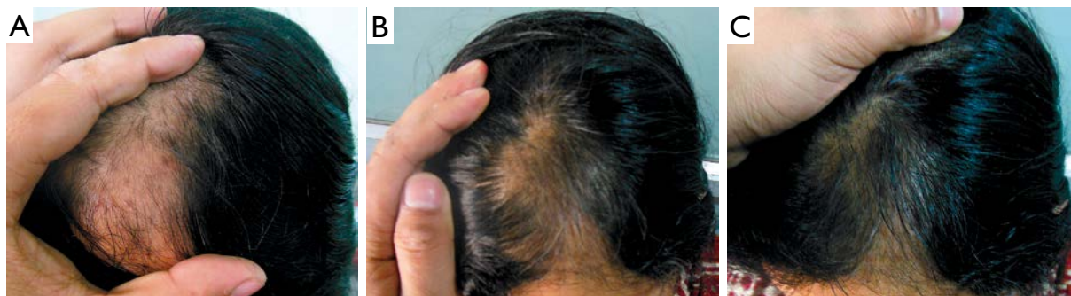
Figure 1. Excimer light: A – pre-treatment, B – after 2 months, C – after 6 months

In the excimer group, 21/32 (61.76%) patients with a single patch and 1/6 (16.67%) with multiple patches achieved > 50% hair regrowth (Table 1, Fig. 1 A–C). In the triamcinolone group, 23/30 (76.67%) with a single patch and 10/16 (62.5%) with multiple patches achieved > 50% hair regrowth (Table 1), and in the minoxidil group, 4/12 (33.33%) patients with a single patch and none, i.e. 0/2, with multiple patches achieved > 50% regrowth (Table 1, Fig. 2 A–C). Regarding the sites of involvement, among those patients who achieved > 50% hair regrowth, 22/32 (68.75%) treated with excimer light had a single patch and 1/6 (16.67%) had multiple patches on the scalp (Table 2), in the triamcinolone group, 22/25 (88%) had a single patch on the scalp, 8/10 (80%) had multiple patches on the scalp, 1/5 (20%) had a single patch and 2/6 (33.33%) had multiple patches on the beard (Table 2, Fig. 2 A–C), and in the minoxidil group, 4/10 (40%) with a single patch on the scalp and none with multiple patches achieved successful results (Table 2, Fig. 3 A–C).