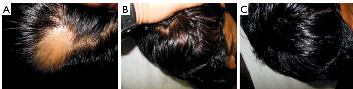
Figure 2. Intralesional triamcinolone: A – pre-treatment, B – partial regrowth after 2 months, C – complete regrowth after 6 months