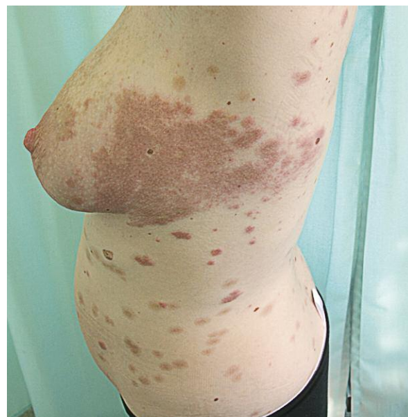
Figure 4. Erythematous urticarial plaque 4 days after partum

Doppler ultrasound. Dyspnea and edema resolved after 2 days of treatment with furosemidum (40 mg a day) and low-molecular heparin (enoxaparinum 60 mg daily). The patient was discharged from the hospital in good condition and advised to continue treatment with cetirizine (20 mg per day) and a topical steroid. During a follow-up visit 3 days later, the patient revealed exacerbation of skin lesions with new bullae on the hands, forearms, and with generalized itching. The patient was treated for 2 months with methylprednisolone (in a decreasing dose from 32 mg to 4 mg per day), a topical medium potency steroid, and cetirizine at a dose of 20 mg per day. The patient showed good response to the treatment and did not present new skin lesions 3 months later.