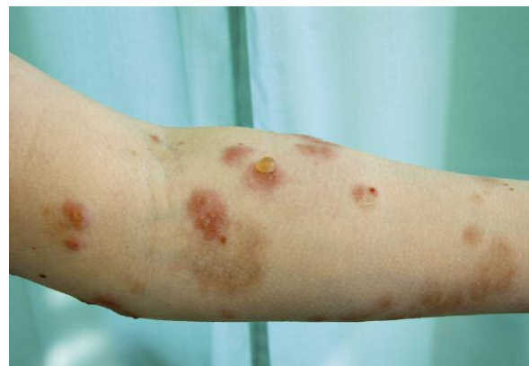
Figure 2. The bullous lesions and erosions localized on the left forearm