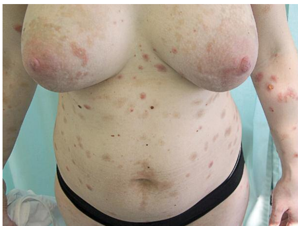
Figure 3. A close up view showing erythematous urticarial papules and plaques