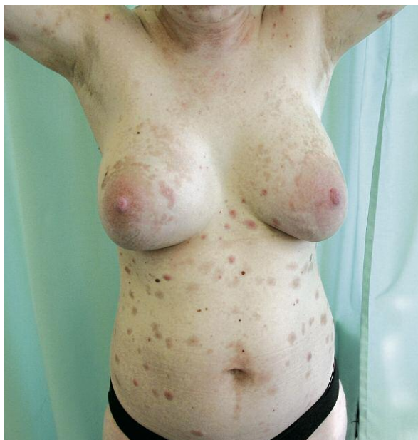
Figure 1. A view showing polymorphic eruption of herpes gestationis