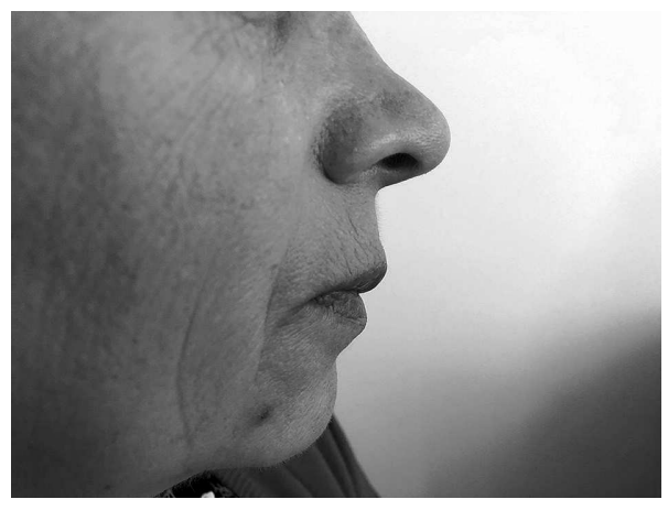
Figure 3. Patient's clinical condition after 3 months of chloroquine therapy

Due to its unclear aetiology, treatment of the MR syndrome is difficult and sometimes associated with resistance to the applied pharmacotherapy and risk of recurrence of symptoms [2]. So far, no standardised therapy