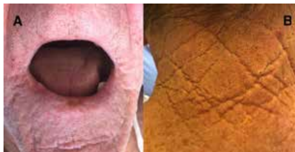
Figure 2. A – The ulceration on the lower lip. B – Increased wrinkling on the neck skin

No standard management for FRD can be found in the literature. The important part of the process is to avoid excessive sun exposure and discontinue smoking. During the conservative treatment, topical retinoids like tretinoin or tazarotene gel are commonly used. The exfoliative actions, the ability to cause expulsion of lesions and to reduce “aged” appearance of the skin made them a popular option for mild courses. Although the retinoids have been proven useful, in more severe cases doctors tend to use them as a complement to other techniques [10]. Invasive treatment involves use of carbon dioxide laser, comedo extraction and plasma exeresis. Surgical