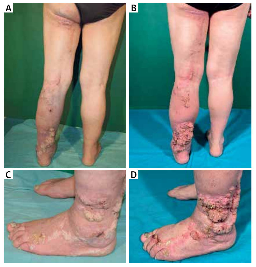
Figure 1. Inflammatory linear verrucous epidermal nevus (ILVEN) on lower left extremity: posterior surface before (A) and after (B) surgical treatment and cryosurgery; dorsum of the foot and lateral ankle before (C) and after (D) surgical treatment and 0.5% 5-FU with 10% salicylic acid solution applications

includes linear psoriasis, lichen striatus, linear Darier disease, linear porokeratosis, linear lichen planus, and carcinoma cuniculatum [4]. To date, no single ILVEN therapy has been proven to be effective in most patients. In reviewing the literature, the descriptions of success-