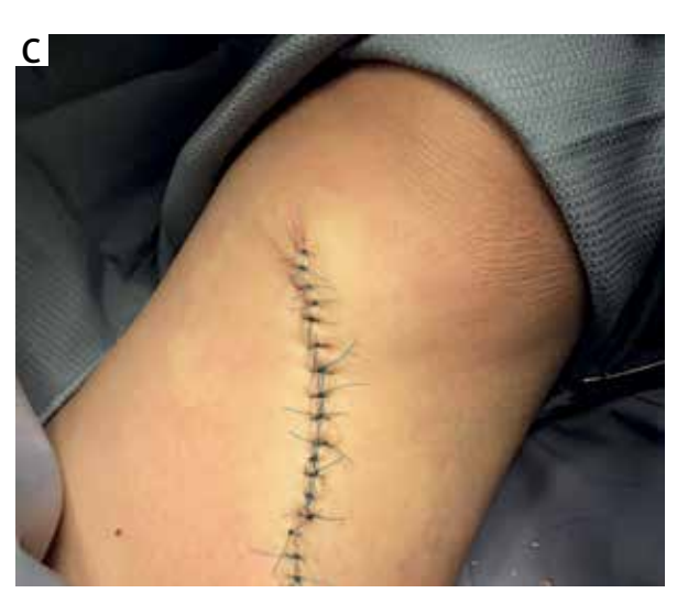
Figure 1. Serial excision of medium-sized congenital melanocytic nevi (CMN) on the right thigh. A – Preoperative view, B – after the first excision, C – after the second excision