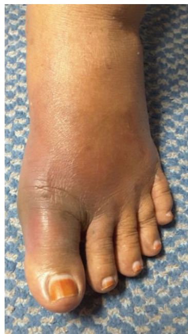
Photo 2. The left foot showed cellulitis and was swollen and inflamed over the right big toe area at presentation (Case 1)

Upon further questioning, the patients claimed she had a left big toe swelling for a week prior to the eye redness. This was associated with low grade fever. Examination of the left foot showed diffuse swelling over the big toe area, extending up to the ankle, with surrounding skin inflammation (Photo 2). There was tenderness at the medial side of the foot, but the swelling did not fluctuate, and there was an absence of pus discharge. A plain radiograph of the left foot showed soft tissue swelling, suggestive of soft tissue inflammation, without evidence of osteomyelitis. Systemically, the patient was afebrile with stable vital signs.