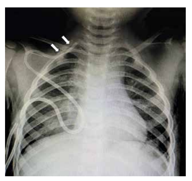
FIGURE 3. Chest X-ray showing the Hickman catheter with the catheter tip lost in the ipsilateral jugular vein. The Hickman catheter became shallower, and its tip became lost in the ipsilateral jugular vein (arrow) 6 days after implantation

the standard approach for Hickman/ Broviac catheter implantation in our institution, the paediatric surgeons scanned the axillary veins of the patient in the Trendelenburg position on both sides and confirmed that the veins were open and intact. The right side was chosen because catheter tip malposition [6] and risk of superior vena cava (SVC) perforation [7, 8] have been reported for CVCs inserted from a patient's left side, even though the success rate to puncture the target vein via the real-time ultrasound-guided left supraclavicular CVC approach is reported to be higher than that with the right supraclavicular approach [9]. Indeed, it is reported that 3.4% of the CVC tips inserted via the left supraclavicular approach using the real-time ultrasound-guided technique were positioned touching the lateral wall of the SVC [6].