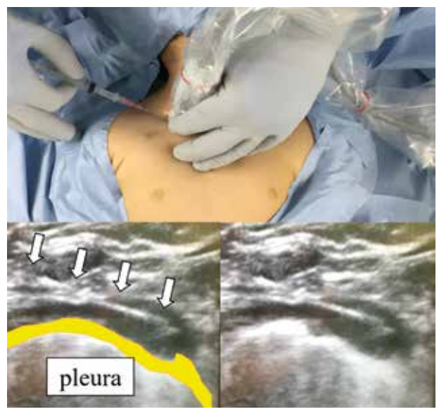
FIGURE 4. Real-time ultrasound-guided supraclavicular approach to the right brachiocephalic vein. The puncture needle (arrow) and its entire passage into the target brachiocephalic vein are visualised in a long-axis in-plane view during the puncture procedure via the real-time ultrasound-guided supraclavicular approach

in the subcutaneous tunnel as with the real-time ultrasound-guided infraclavicular axillary vein approach. The step-by-step procedures for realtime ultrasound-guided supraclavicular tunnelled Hickman/Broviac catheter implantation were introduced in our previous paper with figures and a video [5]. As shown in Figure 4, the puncture needle and its entire passage into the target brachiocephalic vein are visualised in a long-axis inplane view during the puncture procedure with the real-time ultrasoundguided supraclavicular approach. The brachiocephalic vein is larger than that of the internal jugular or subclavian vein because it is located more proximally than their confluence. In contrast, the axillary vein is smaller than the subclavian vein because it is located more peripherally [12]. The subcutaneous tunnel of the Hickman/Broviac catheter inserted via the supraclavicular approach passes over the clavicle [5]. To prevent accidental removal of the catheter during manipulation to create the subcutaneous tunnel and catheter fixation (a pitfall of the right supraclavicular approach for CVC or Hickman/Broviac catheter implantation), it should be noted that the CVC insertion depth via the right supraclavicular approach is significantly shorter than that of the right jugular vein or the left supraclavicular approach to locate the catheter tip at the carina level [6].