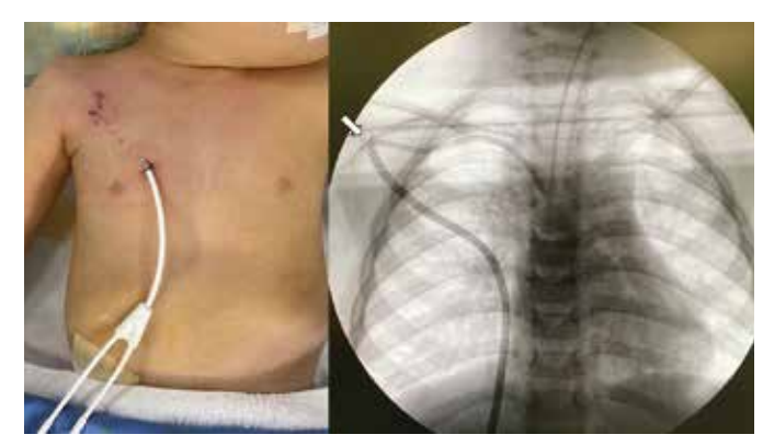
FIGURE 1. A Hickman catheter implanted via the right real-time ultrasound-guided infraclavicular axillary vein approach with a subcutaneous tunnel with its exit inside the ipsilateral nipple to obtain sufficient subcutaneous tunnel length. The chest X-ray shows that the calibre change portion of the Hickman catheter was positioned just at the sharp curve in the subcutaneous tunnel, and its lumen was bent and occluded (arrow)

Anaesthesiol Intensive Ther 2021; 53, 3: 274–276