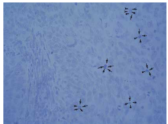
Figure 2. Signals produced by EBV probe in nuclei in warty carcinoma case. ISH 400×

Warty carcinoma of the uterine cervix is a specific, rare subtype of squamous cell carcinoma. It