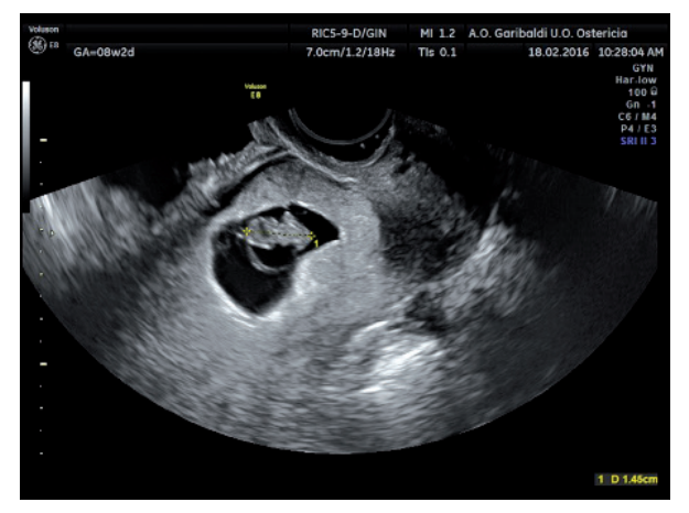
Fig. 3. Caesarean scar pregnancy and crown-rump length

tient, by an accurate counseling, which are the different types of treatments of this clinical condition.