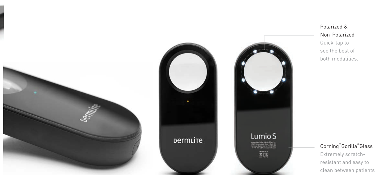
Polarized & Non-Polarized Quick-tap to see the best of both modalities.

structures invisible to the naked eye. Simply tap & hold to turn on the device, quick-tap to change between two sets of polarized and non-polarized LEDs. The minimalist design of Lumio S is even more functional than simply cool. A clean, elegant exterior with only a single USB jack is much easier to keep