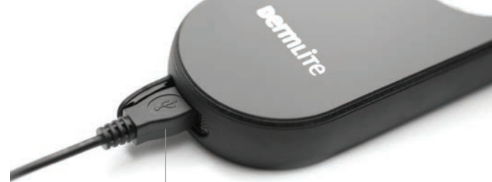
USB convenience Compatible with your smartphone charger, your PC or any USB jack; no custom charger needed.