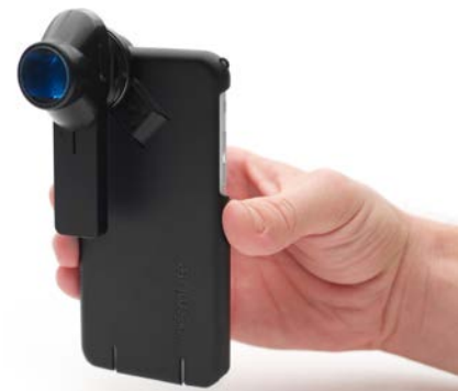
DL1 & iPhone