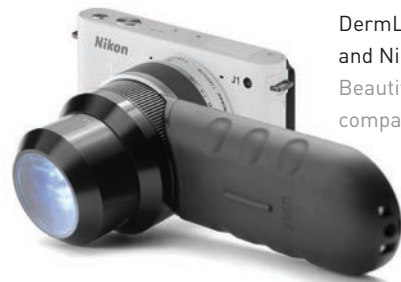
DermLite DL3N and Nikon 1 Beautiful images in a compact package