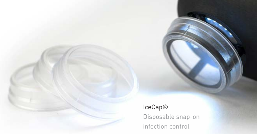
IceCap® Disposable snap-on infection control