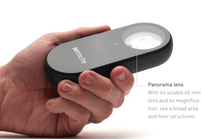
Panorama lens With its sizable 40 mm lens and 4x magnification, see a broad area and finer structures.